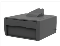
TALL SINGLE DRAWER DARK GREY 97-989-622

Additional accessories available in white