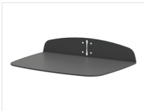
UTILITY SHELF DARK GREY 97-507-282