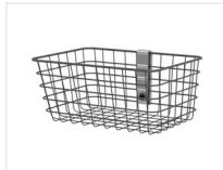
SMALL WIRE BASKET DARK GREY 98-136-282