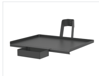
FRONT SHELF DARK GREY 98-417-282