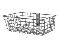
LARGE WIRE BASKET DARK GREY 98-135-282