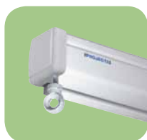
High quality manual projection screen