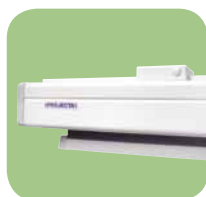
Easy Install with plastic mounting brackets