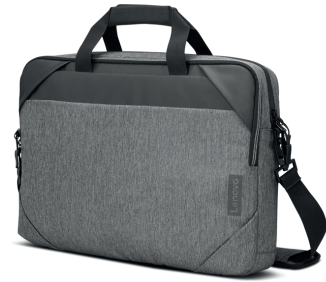
Lenovo Business Casual 15.6" Topload Briefcase