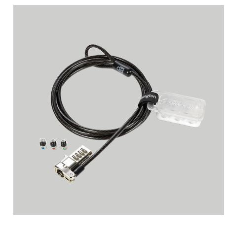
Carbon Steel Cable

1.8m (6 ft.) cable with plastic sheath delivers cut and theft resistance.