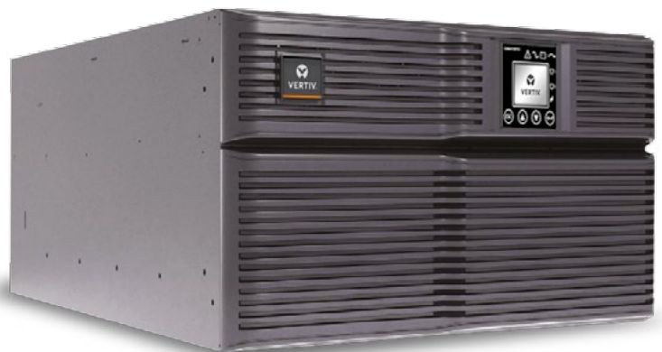
Liebert GXT4 5 - 10 kVA