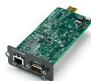
Vertiv IntelliSlot Communication Card