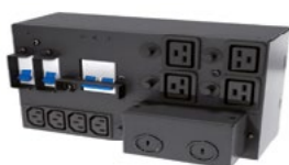
Front view Power Distribution (PD2-CE10HDWRMBS)