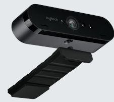
BRIO + Removable Clip