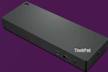
ThinkPad Workstation Thunderbolt™ 4 Dock