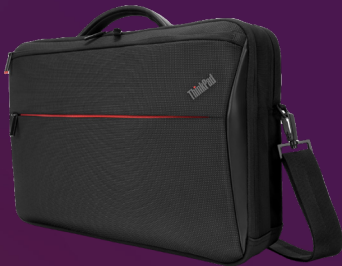
ThinkPad 14-inch Professional Slim Topload