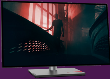
ThinkVision P27h-30 Display