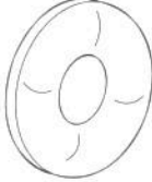
14101-49 Leatherette ear cushion (large) x 10