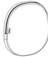
14101-31 Carry pouch x 10