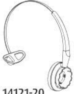
14121-20 Headband (mono only)