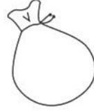
14101-40 Carry bag x 10