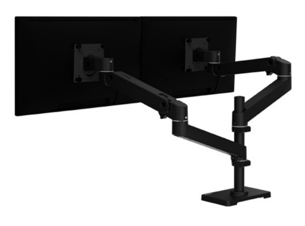
ADD UP TO THREE ARMS WITH DISPLAY ARM EXPANSION KIT (ONLY FOR LARGE BASE) #98-734