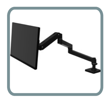
MONITOR ARM EXTENSION #98-731