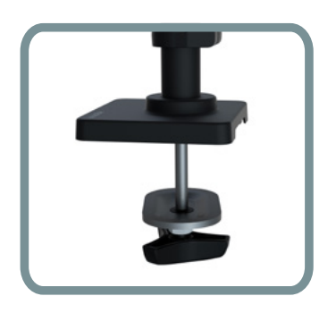
GROMMET MOUNT #98-728