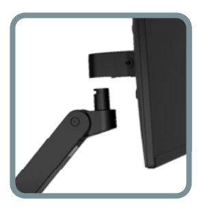
DETACHABLE HEAD: MAKES SET-UP AND MONITOR SWAPS A BREEZE