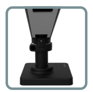
SAVE ROTATION STOP: PREVENT DAMAGE TO WALLS, PARTITIONS, OR CUBICLES