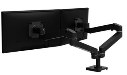
SINGLE TO DUAL SIDE-BY-SIDE CONVERSION KIT #98-745