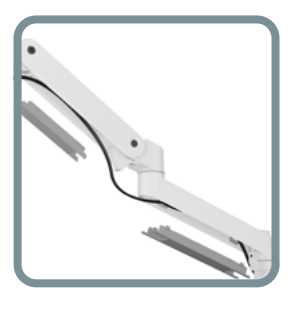
CONVENIENT CABLE COVER: FASTER INSTALLATION AND SLEEKER LOOK