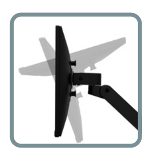
EXTENSIVE TILT RANGE: BETTER ERGONOMICS FOR USERS