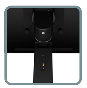
SMART TENSION INDICATOR: SET TENSION LEVEL ONCE AND REPEAT FOR QUICK INSTALL OF MULTIPLE WORKSTATIONS