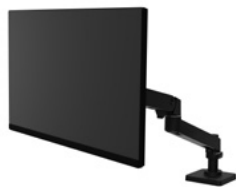
LX Pro Desk Arm