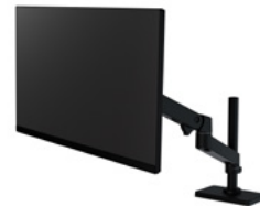
LX Pro Desk Arm, Tall Pole