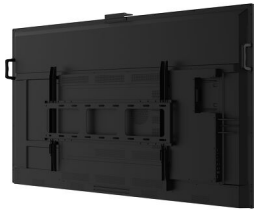
TE INTERACTIVE SERIES iiyama MOUNTING BRACKET FOR WEBCAM