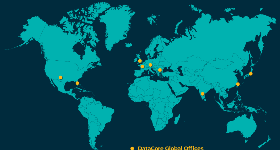
● DataCore Global Offices