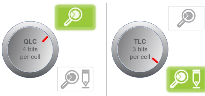
Figure 1: QLC is ideal for read-mostly workloads, TLC for read/write (mixed-use)

QLC NAND packs 33% more data into every cell compared to its triple-level cell (TLC) equivalent. QLC's additional storage density — coupled with a more approachable price point — can have an immense effect on your read-mostly workloads (TLC is best for mixed use).