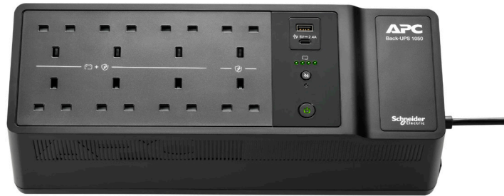
Model shown: BE1050G2-UK