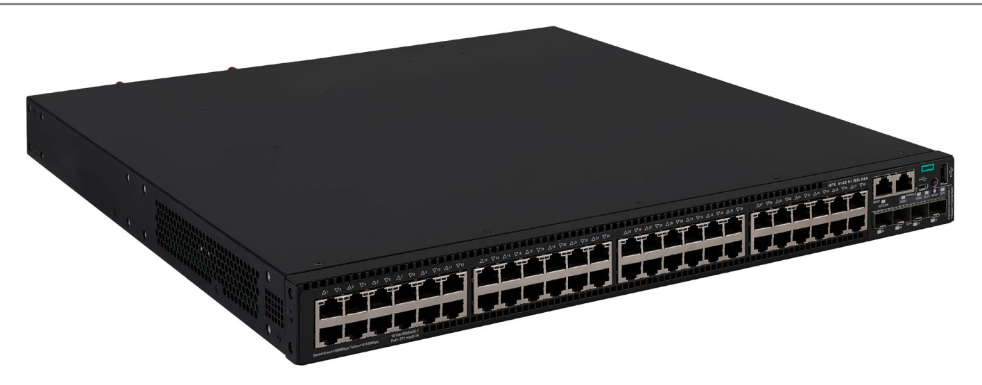
HPE FlexNetwork 5140 HI Switch Series

This switch series also includes Smart MC at no additional cost and combined with Intelligent Management Center (IMC), provides both embedded network management, enhanced network visibility and automation