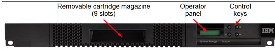
Figure 2. Front view of the TS2900 Tape Autoloader

The following figure shows the front of the TS2900 Tape Autoloader.