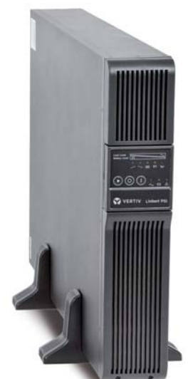
Liebert PSI 2U Tower version