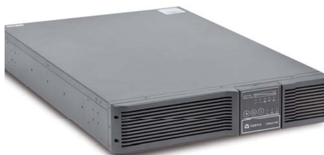
Liebert PSI 2U Rack version