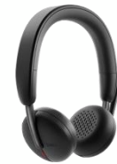
Dell Pro Wireless Headset - WL3024

Work quietly in any space with a compact, silent keyboard and mouse combo that connects seamlessly with dual-mode connectivity.