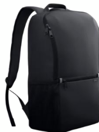
Dell 14-16 EcoLoop Backpack - CP3724

Collaborate confidently with this 2K QHD webcam that's essential for everyday use.