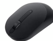
Dell Pro Mouse - MS300

A sustainably made, everyday backpack with a large, full-access front opening and protection features that shield your laptop and essentials.