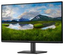
Dell Pro 27 Monitor - E2725HM

Get the essentials to enhance productivity with this 27-inch fixed-stand monitor certified by TÜV Rheinland® for 3-star eye comfort.