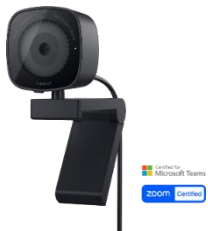
Dell Webcam - WB3023

Experience uninterrupted communication with this wireless headset featuring an AI-based noise cancellation microphone, designed with productivity and comfort in mind for all-day conferencing.