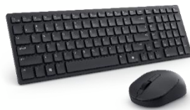
Dell Pro Compact Silent Keyboard and Mouse - KM555

Get the essentials to enhance productivity with this 27-inch fixed-stand monitor certified by TÜV Rheinland® for 3-star eye comfort.