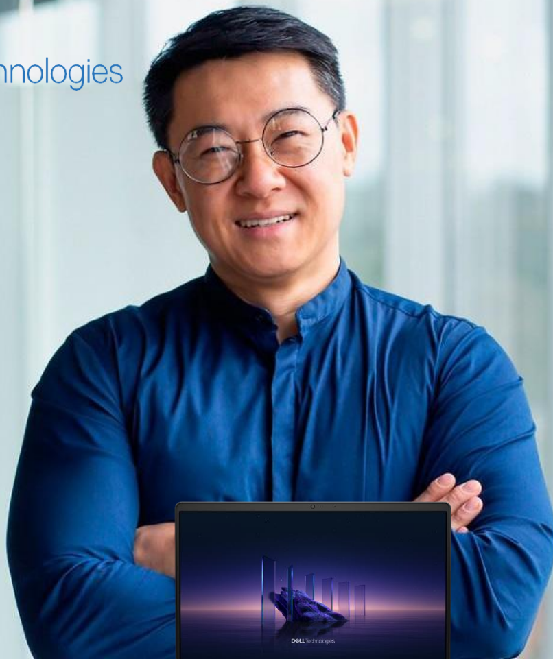
Dell Pro 14 Essential (PV14250/PV14255)