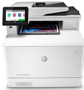
HP Color LaserJet Pro M479dw

Winning in business means working smarter. The HP Color LaserJet Pro MFP M479 is designed to let you focus your time where it's most effective—growing your business and staying ahead of the competition.