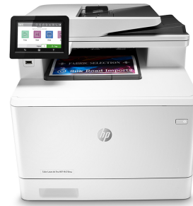
HP Color LaserJet Pro M479fnw

Dynamic security enabled printer. Only intended to be used with cartridges using an HP original chip. Cartridges using a non-HP chip may not work, and those that work today may not work in the future. Learn more at: http://www.hp.com/go/learnaboutsupplies