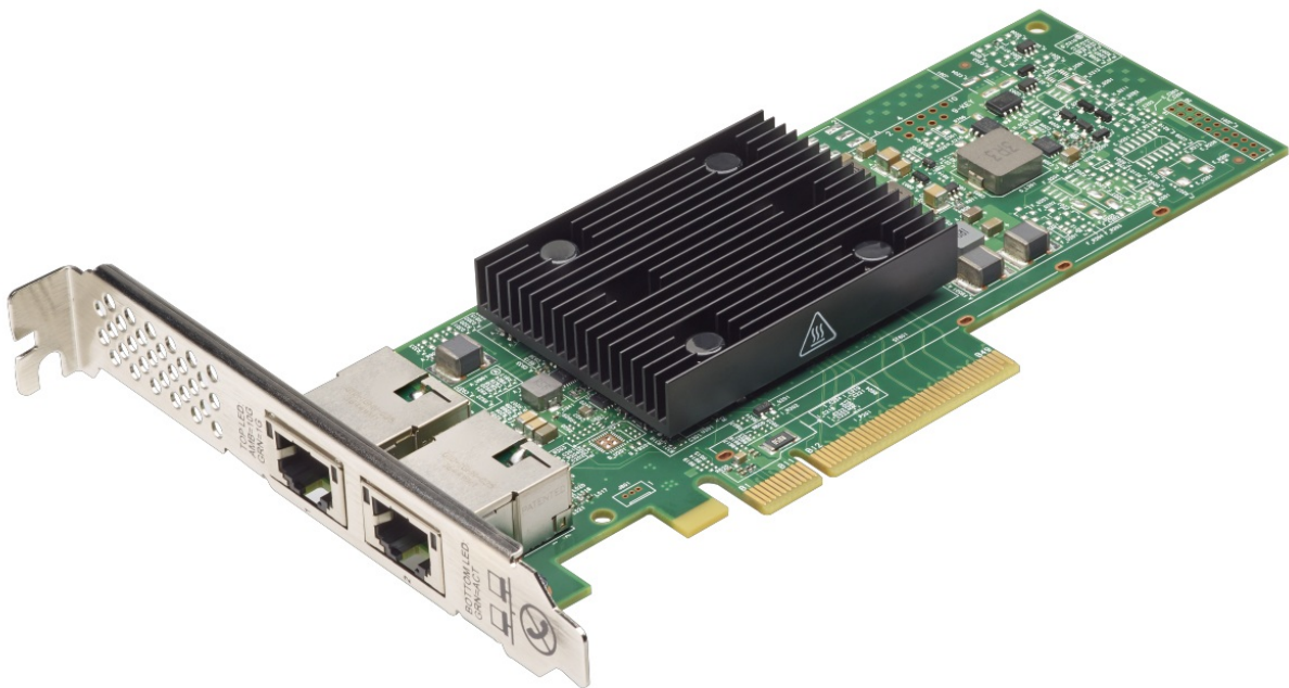
Figure 2. ThinkSystem Broadcom NX-E PCIe 10Gb 2-Port Base-T Ethernet Adapter

The following figure shows the ThinkSystem Broadcom NX-E PCIe 10Gb 2-Port Base-T Ethernet Adapter.