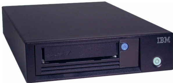
Figure 2. TS2270 Tape Drive for Lenovo

The following figure shows the TS2270 Tape Drive.