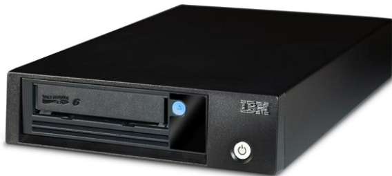
Figure 3. TS2260 Tape Drive for Lenovo

The following figure shows the TS2260 Tape Drive.