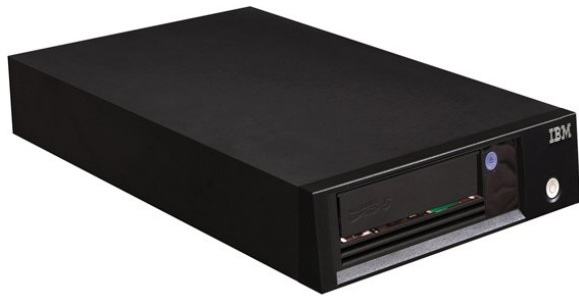
Figure 4. TS2250 Tape Drive for Lenovo

The following figure shows the TS2250 Tape Drive.