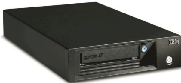
Figure 1. TS2280 Tape Drive for Lenovo

The LTO Ultrium Tape Drives from Lenovo are excellent choices if you use tape drives that require larger-capacity or higher-performance tape backup. The TS2280, TS2270, TS2260, and TS2250 Tape Drives are an excellent choice for tape backup solutions for Lenovo servers.