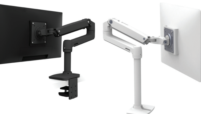
CABLES ROUTE BENEATH THE ARM, OUT OF THE WAY

WHITE GROMMET MOUNT KIT ACCESSORY 98-034: ATTACHES THROUGH SURFACE HOLE