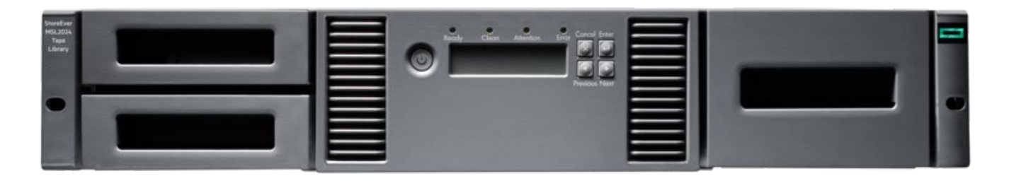
HPE StoreEver MSL2024 Tape Library