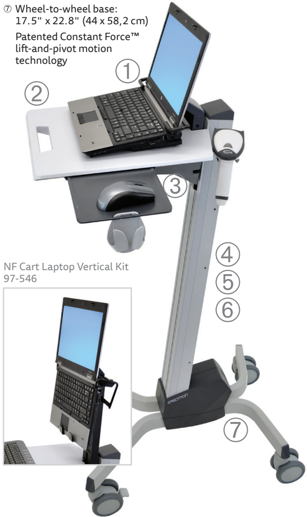
NF Cart Laptop Vertical Kit 97-546