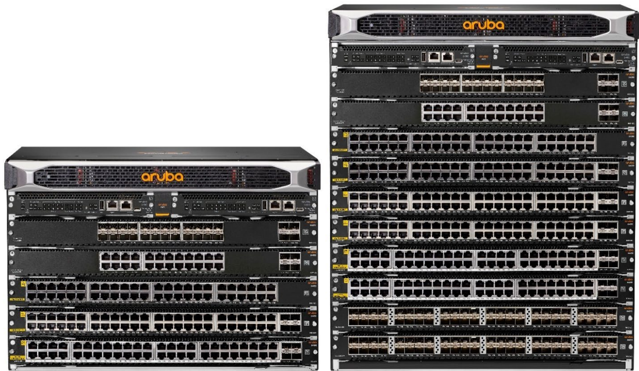
Aruba CX 6400 Switch Series

Aruba Dynamic Segmentation extends Aruba's foundational wireless role-based policy capability to Aruba wired switches. What this means is that the same security, user experience and simplified IT management can be enjoyed throughout the network. Regardless of how users and IoT devices connect, consistent policies are enforced across wired and wireless networks, keeping traffic secure and separate.