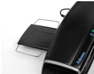
Back tray to support the laminated document