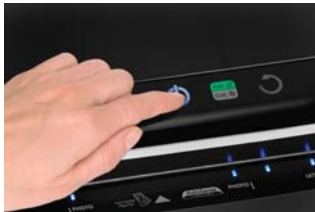
Touch panel power button

Fully automatic Laminator with Instaheat