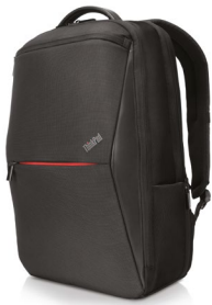
ThinkPad Professional 15.6" Backpack