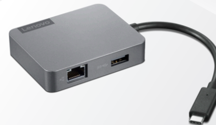
LENOVO USB-C TRAVEL HUB GEN 2 PN: 4X91A30366

The perfect travel companion to keep you productive and efficient anywhere you go. Loaded with video ports (HDMI and VGA), Gigabit Ethernet Port, and USB ports, you can extend your PC, connect to a network, and transfer data with ease. Built to move, this USB-C travel hub fits in your backpack, so you're always prepared, wherever you may be.