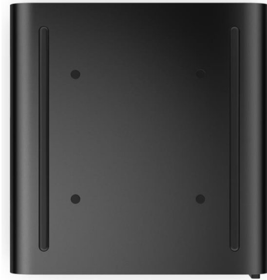
HP Z2 G9 Mini Workstation Desktop PC, bottom view

Removable VESA cap for access to integrated VESA mounting holes