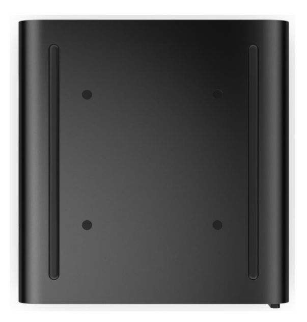
HP Z2 G9 Mini Workstation Desktop PC, bottom view

Removable VESA cap for access to integrated VESA mounting holes