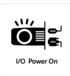
I/O Power On

With the HDMI Power On function, the projector is able to turn on automatically when the projector receives a signal via HDMI or VGA. You no longer need to start the projector separately, but can simply switch on your notebook, receiver or game console and the projector will automatically switch on as well.