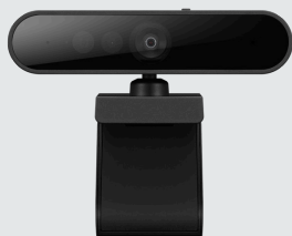
Lenovo Performance FHD Webcam (PN: 4XC1D66055)

It's a reliable digital video device to transfer video data with HD quality through a high-speed USB interface in Full HD mode delivers clear images for all your videoconferencing needs. It's easy to operate, and functional mechanical mechanism creates an excellent user experience. The built-in dual microphones provide clear audio that you can count on.