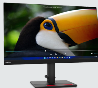
ThinkVision T12Q-20 Monitor 2 (PN: 61EDGAR2WW)

It's a reliable digital video device to transfer video data with HD quality through a high-speed USB interface in Full HD mode delivers clear images for all your videoconferencing needs. It's easy to operate, and functional mechanical mechanism creates an excellent user experience. The built-in dual microphones provide clear audio that you can count on.