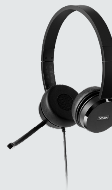
Lenovo 100 Stereo USB Headset 2 (PN: 4XD0X88524)

Connect both keyboard and mouse seamlessly using a wireless 2.4 GHz dongle. The spill-resistant, wireless keyboard with low profile land-style keys and adjustable tilt leg is responsive and easy to use. The full-size wireless mouse accommodates left- and right-handed users with an ambidextrous design, and 1200 DPI resolution gives more precision and control. It comes with a one-year warranty.