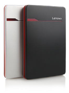
USB3.0 External Backup Hard Drive

Comfortable fitting, universal VoIP optimized headphones that come with double-sided ear pieces help you focus on the call by blocking out unwanted sound. Adjustable headset and 180° microphone provide excellent sound clarity, be it on VoIP or regular phone calls.