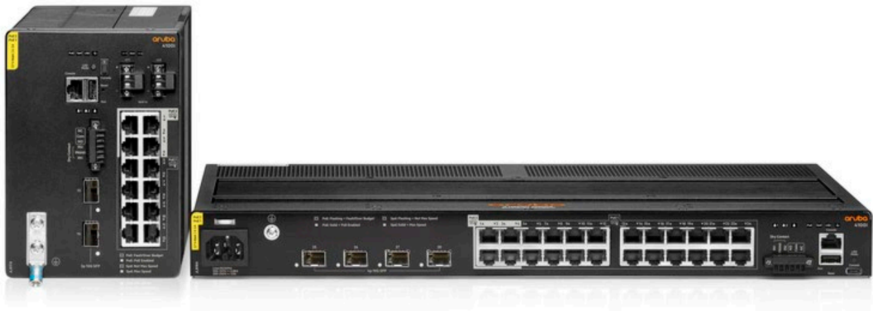
HPE Aruba Networking 4100i Rugged Switches

As part of HPE Aruba Networking's Edge Services Platform (ESP), HPE Aruba Networking CX switches play a foundational role in the Unified Infrastructure. Automation, embedded analytics, high availability, and secure segmentation are designed into CX switches with HPE Aruba Networking Central 1 delivering a unified, single view of the network that maximizes operational efficiency across enterprise networks. Dynamic segmentation extends HPE Aruba Networking's foundational wireless role-based policy capability to HPE Aruba Networking wired switches. What this means is that the same security, user experience and simplified IT management can be enjoyed throughout the network. Regardless of how users and IoT devices connect, consistent policies are enforced across wired and wireless networks, keeping traffic secure and separate.