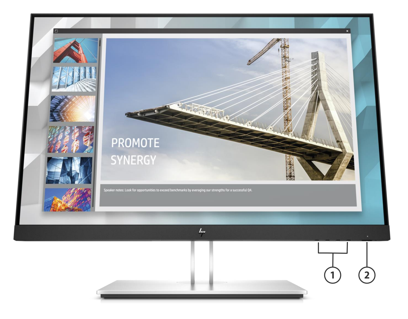
1. OSD Buttons