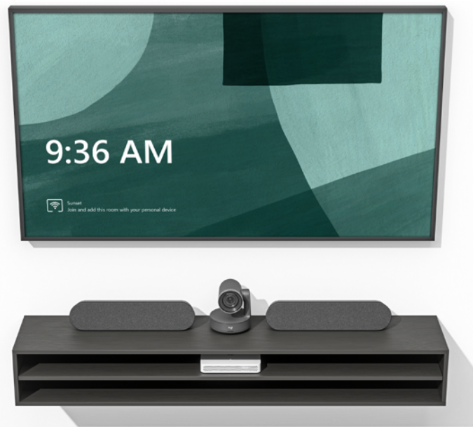
Logitech RoomMate shown with Rally Plus system