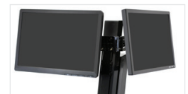
Dual Monitor Double-Hinged Bow #98-101-009 (black) Upgrade an existing dual monitor WorkFit with the ultimate in viewing-angle control (Compatible with #33-341-200, #33-349-200 and #33-349-211)

Download additional resources at ergotron.com . For more information: NORTH AMERICA: 800.888.8458 / +1.651.681.7600 / sales@ergotron.com EMEA: +31.33.45.45.600 / info.eu@ergotron.com APAC: apaccustomerservice@ergotron.com OEM: info@oem.ergotron.com