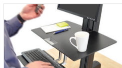
Worksurface for WorkFit-S #97-581-019 (black) Add a worksurface with handle to a WorkFit-S, Single LD or Dual (Compatible with #33-342-200 and #33-341-200)