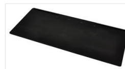
Deep Keyboard Tray for WorkFit #97-897 (black) Upgrade any WorkFit-S with a larger, extra-deep keyboard tray