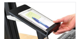
Tablet/Document Holder (with lift handle) #97-558-200 (black) Add a document holder to the front of a WorkFit-S to keep a tablet or other items easily accessible (Compatible with #33-342-200 and #33-341-200)