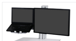
WorkFit Conversion Kit: Dual to LCD & Laptop #97-938-062 (white) #97-617 (black) Converts a WorkFit-S, Dual into an LCD & Laptop Workstation (Compatible with #33-341-200, #33-349-200 and #33-349-211)