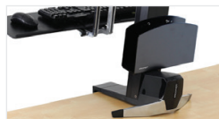
Small CPU Holder #80-063-200 (black)