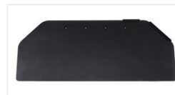
Corner Keyboard Tray for WorkFit #97-898 (black) A keyboard tray designed to allow the keyboard to drop below table height in a corner work space (Compatible with #33-342-200 and #33-341-200)