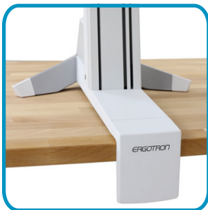
DESK CLAMP ATTACHES TO SURFACE EDGE .47–2.4" (1,2–6 CM) THICK