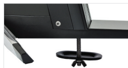
Grommet Mount #97-649-085