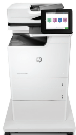
HP Color LaserJet Enterprise MFP M681 f