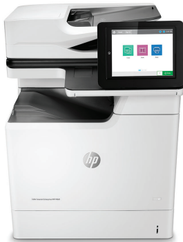
HP Color LaserJet Enterprise MFP M681 dh

This HP Color LaserJet MFP with JetIntelligence combines exceptional performance and energy efficiency with professional-quality documents right when you need them—all while protecting your network with the industry's deepest security. 1