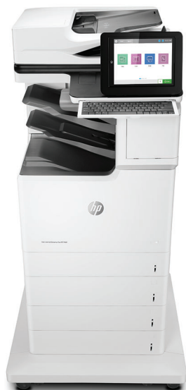
HP Color LaserJet Enterprise Flow MFP M681 z