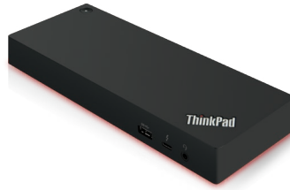
ThinkPad® Thunderbolt™ Workstation Dock