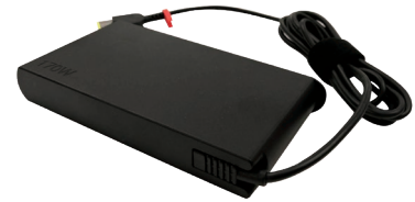
New Slim ThinkPad® 230W AC Adapter