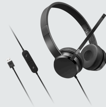
LENOVO USB-A WIRED STEREO ON-EAR HEADSET WITH CONTROL BOX (PN: 4XD1K18260)

Connect both keyboard and mouse seamlessly using a wireless 2.4 GHz dongle. The spill-resistant, wireless keyboard with low profile island-style keys and adjustable tilt leg is responsive and easy to use. The full-size wireless mouse accommodates left- and right-handed users with an ambidextrous design, and 1200 DPI resolution gives more precision and control. It comes with a one-year warranty.