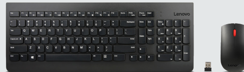
LENOVO ESSENTIAL WIRELESS COMBO KEYBOARD & MOUSE (PN: 4X30M394XX)

Boost your productivity with ThinkVision T27q-20, a 27-inch monitor equipped with a QHD, In-Plane Switching (IPS) panel for distortion-free images. The 3-sided NearEdgeless bezel offers a wider screen real estate, while the versatile connection options, including HDMI, DP, and multiple USB 3.1 Gen1 ports, facilitate easy connectivity with peripherals for faster and smoother data transfer.