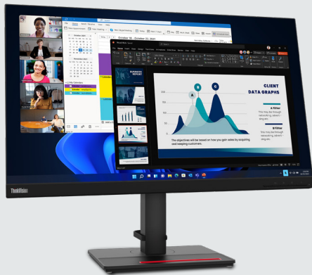
THINKVISION T27Q-20 MONITOR (PN: 61EDGAR2WW)

Boost your productivity with ThinkVision T27q-20, a 27-inch monitor equipped with a QHD, In-Plane Switching (IPS) panel for distortion-free images. The 3-sided NearEdgeless bezel offers a wider screen real estate, while the versatile connection options, including HDMI, DP, and multiple USB 3.1 Gen1 ports, facilitate easy connectivity with peripherals for faster and smoother data transfer.