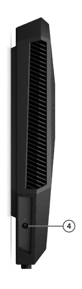
Left side view