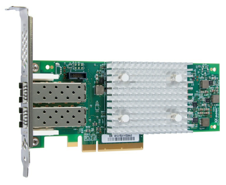
Figure 1. ThinkSystem QLogic QLE2742 PCIe 32Gb 2-Port SFP+ Fibre Channel Adapter (shown without the included 32 Gb transceivers)

The QLogic 2-port 32 Gb Fibre Channel HBA is shown in the following figure.