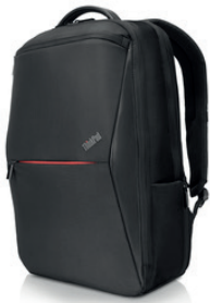
ThinkPad® Professional 15.6" Backpack