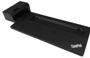
ThinkPad Pro Docking Station