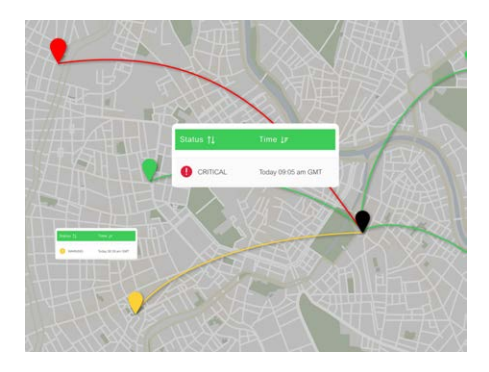
Remote UPS firmware distribution and upgrade

Monitors on-site power availability with outage/power restored notifications