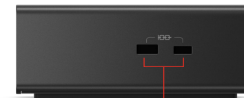
Kensington Lock Slots