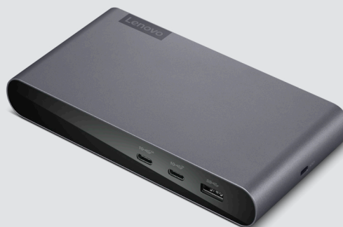
LENOVO USB-C UNIVERSAL BUSINESS DOCK PN: 40B30090XX

This sleek and stylish full-size mouse design offers exceptional quality in a modern wireless solution. The compact ambidextrous mouse provides excellent portability and perfect ergonomics. Complete tasks with ease using the precise 1200 DPI optical sensor. Connect compatible Lenovo devices with just one nano receiver.