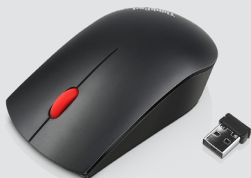
THINKPAD ESSENTIAL WIRELESS MOUSE PN: 4X30M56887

This sleek and stylish full-size mouse design offers exceptional quality in a modern wireless solution. The compact ambidextrous mouse provides excellent portability and perfect ergonomics. Complete tasks with ease using the precise 1200 DPI optical sensor. Connect compatible Lenovo devices with just one nano receiver.