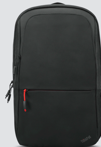
THINKPAD ESSENTIAL 16-INCH BACKPACK (ECO) PN: 4X41C12468

Designed for modern professionals, the Lenovo USB-C Universal Business Dock has everything that helps boost your productivity to the next level. With enhanced port expansion, optimum power delivery, and dual display support in a small space-saving, stylish exterior, the dock is the perfect companion for hybrid workspaces.