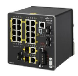
16 copper ports (incl. 4 PoE/ PoE+ ports)+ 2 combo ports 5.1 x 5.0 x 5.26 in