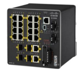
16 copper + 2 combo ports 5.1 x 5.0 x 5.26 in