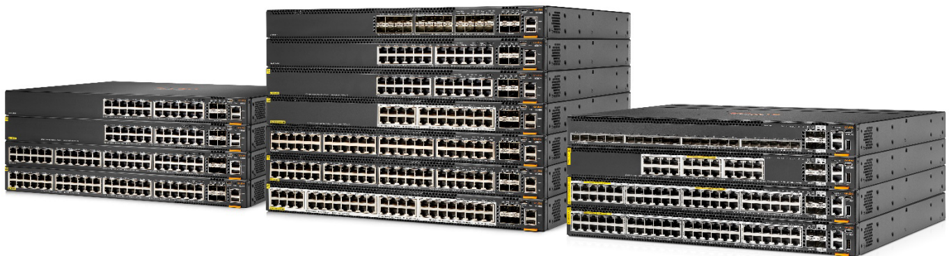
HPE Aruba Networking CX 6300 Switch Series

HPE Aruba Networking Dynamic Segmentation extends HPE Aruba Networking's foundational wireless role-based policy capability to HPE Aruba Networking wired switches. What this means is that the same security, user experience and simplified IT management can be enjoyed throughout the network. Regardless of how users and IoT devices connect, consistent policies are enforced across wired and wireless networks, keeping traffic secure and separate.