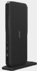
Acer USB Type-C Dock III