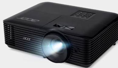
4,500 Lumens SVGA Projector X1128HK