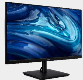
24" ZeroFrame FHD Monitor VA2 series