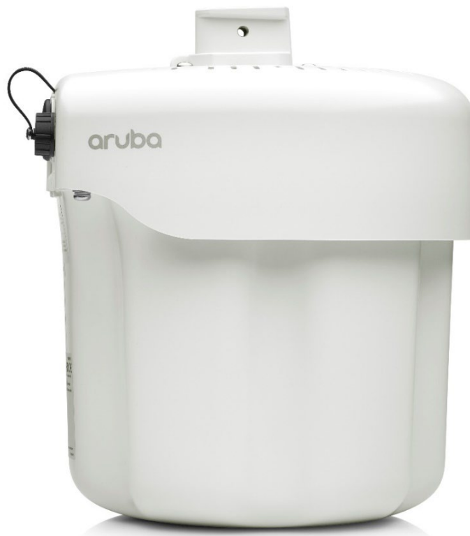
Aruba 370 Series Access Points

Like all Aruba Wi-Fi 6 APs, the 370 Series includes an integrated Bluetooth Low Energy radio to simplify the deployment and management of location services, asset tracking services, security solutions and IoT sensors. This allows organizations to leverage the 370 Series as an IoT platform, which eliminates the need for an overlay infrastructure and additional IT resources.